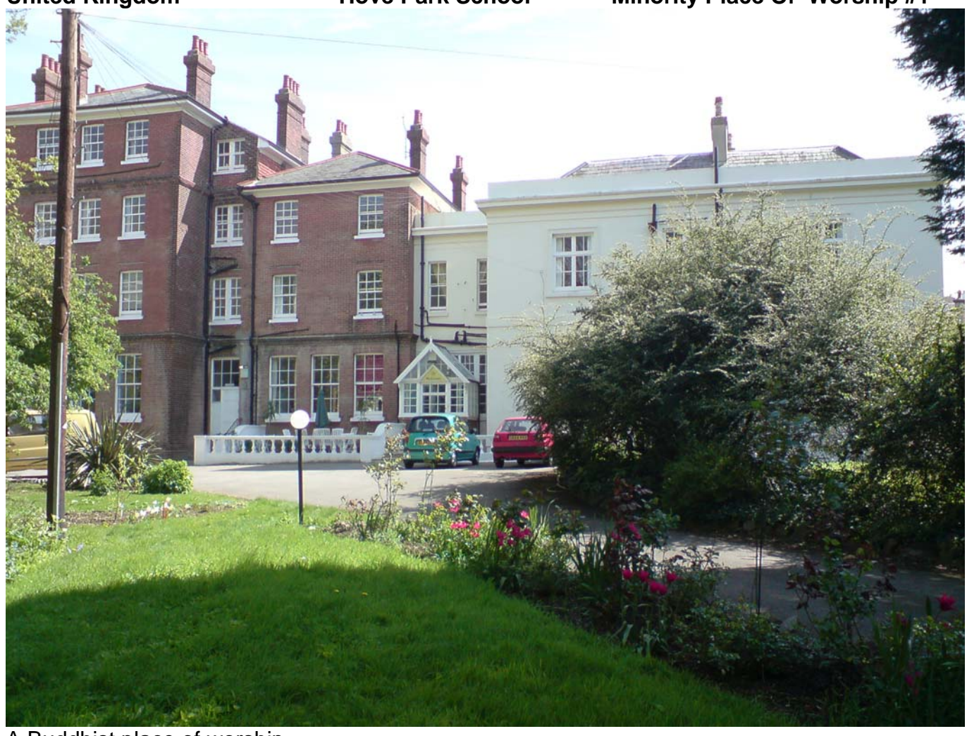
A Buddhist place of worship, and The World Peace Cafe & Peace Garden open to the public